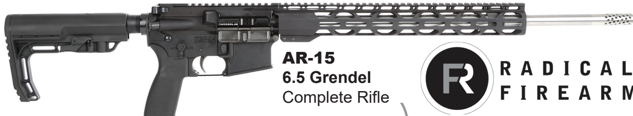
AR-15 6.5 Grendel Complete Rifle